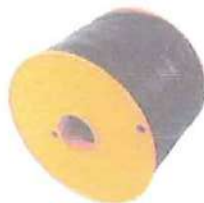
Flat Cord #18