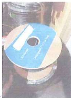
1 Roll Microphone Cable