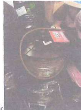
1 Roll Instrument Cable