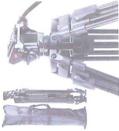
Heavy Duty Tripod