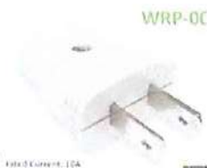
Male Plug Outlet

Extension Universal Outlet with Ground 3 Gang, Surface Type Outlet with Ground 3 Gang Universal