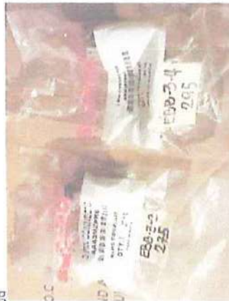
Male and Female XLR plug